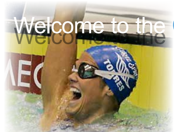
Former Coral Springs Swim Club Swimmer // Dara Torres Five-time Olympian (2008, 2000, 1992, 1988 & 1984); 12-time Olympic Medalist; First American to swim in 5 Olympic Games.

The Coral Springs Swim Club is a year-round competitive swimming program for children, teenagers and young adults. CSSC is a member of the United States Swimming, the Olympic development program for competitive swimming. The Coral Springs Swim Club has consistently ranked in the top four swim clubs in the nation for teaching stroke excellence. In addition, CSSC won nine Florida Gold Coast Junior Olympics Championship titles in the past ten years, and in 2008, eight of the CSSC swimmers participated in the Beijing Olympic Games, including three-time silver medalist Dara Torres.